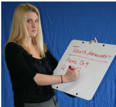
Step 1. Identify the threat.

Emergency Use: First and foremost, always follow your approved school procedure in the event of an emergency. As a last line of defense, the following actions can help protect against an intruder: