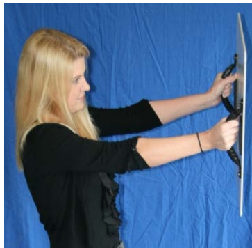
Step 2. Grip rear handles.