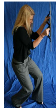
Step 3. Position shield in front of body and minimize exposed body areas.